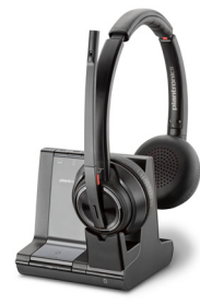
Savi 8200 Office UC Series