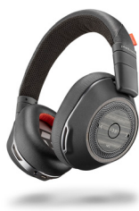
Voyager 8200 UC