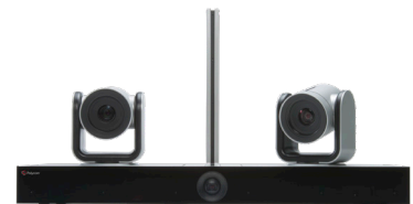
EagleEye Director II