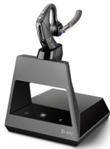
Voyager 5200 Office UC Series

The Poly Blackwire family gives you a broad selection of corded UC devices that deliver outstanding audio quality and reliability, ease of use and price points to meet any budget.