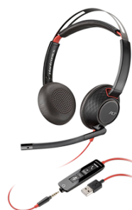
Blackwire 5200 Series