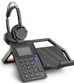
Elara 60 Series