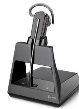
Voyager 4245 Office