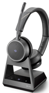
Voyager 4200 Office UC Series