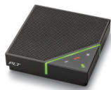
Calisto 7200 (-M)