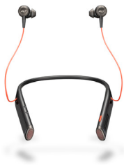
Voyager 6200 UC