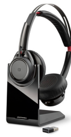
Voyager Focus UC