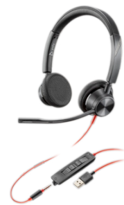
Blackwire 3300 Series (-M)