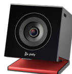
EagleEye Cube USB